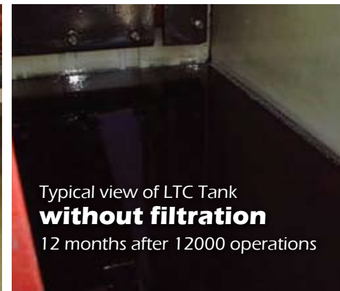
Typical view of LTC Tank without filtration 12 months after 12000 operations