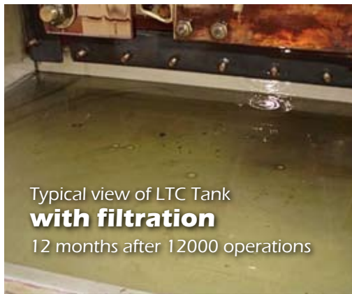
Typical view of LTC Tank with filtration 12 months after 12000 operations

Facet Filtration maintains insulating oil cleaner than new oil cleanliness levels by removing metallic, particulate, and water contamination to aerospace specifications. Super clean oil eliminates the precursors to oil oxidation that leads to the formation of sludge and coking in tap changers. Facet Filtration eliminates insulating oil replacement cost and indefinitely extends costly routine load tap changer maintenance.