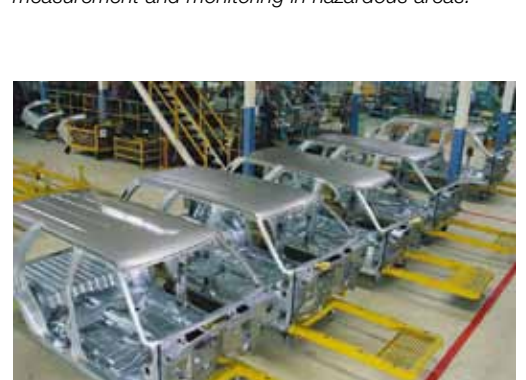
From paint curing to thermoforming, noncontact temperature measurement provides consistent product quality in the automotive industry.