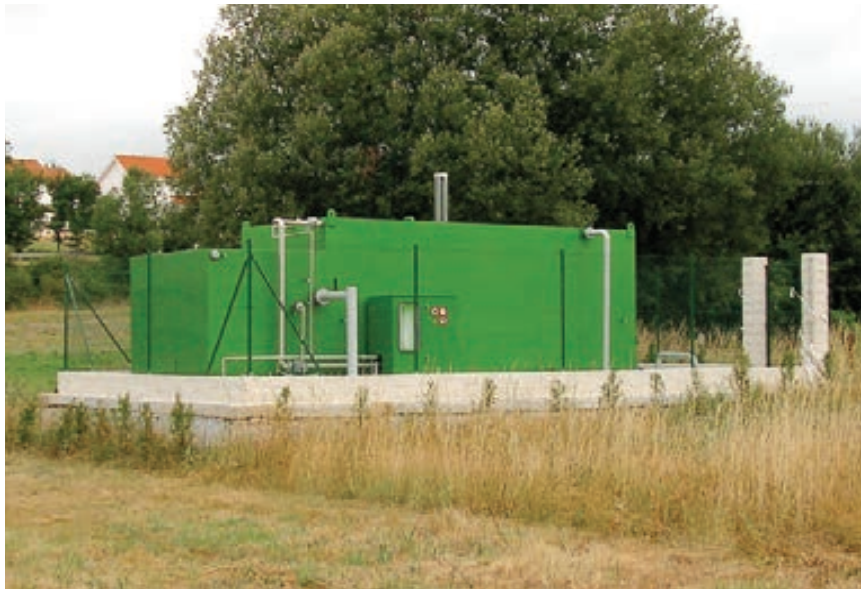
A MERCA OURENSE Rural area of A Manchica

Equivalent Inhabitants: 351 Treated Flow Rate: 24,360 m 3 /year Discharge: Barbaña River