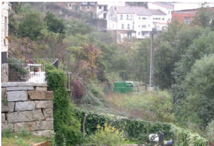
A PEROXA OURENSE Touristic Villa of Os Peares, Popular River Beach

Equivalent Inhabitants: 386 Treated Flow Rate: 33,200 m 3 /year Discharge: Miño River