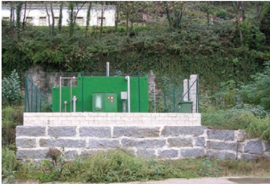
A PEROXA OURENSE Touristic Villa of Os Peares, Rail Station

Equivalent Inhabitants: 351 Treated Flow Rate: 24,360 m 3 /year Discharge: Barbaña River