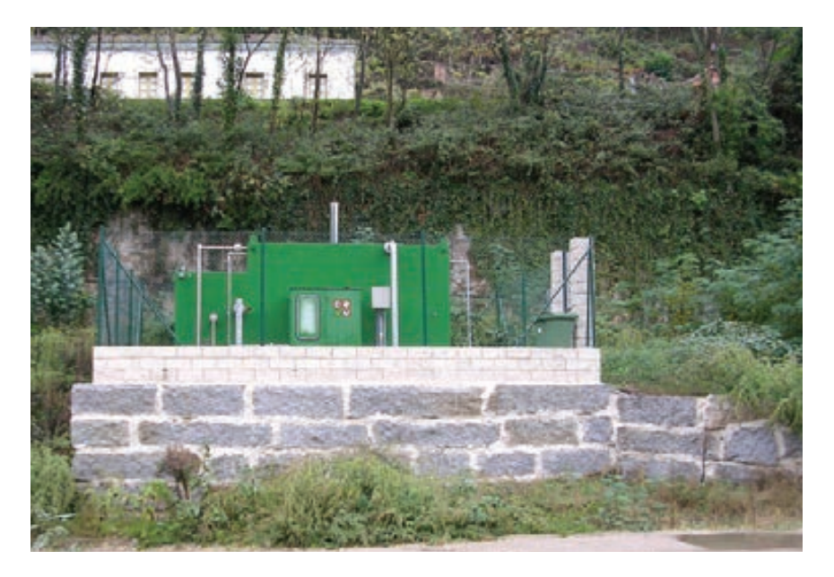
A PEROXA OURENSE Touristic Villa of Os Peares, Rail Station

Equivalent Inhabitants: 351 Treated Flow Rate: 24,360 m³/year Discharge: Barbaña River