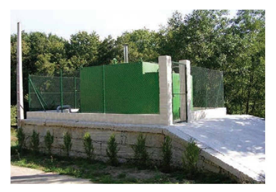
LEIRO OURENSE Vineyard area of Vieite. Denomination of Origin of Ribeiro Wine

Equivalent Inhabitants: 126 Treated Flow Rate: 10,360 m³/year Discharge: Avia Fish River