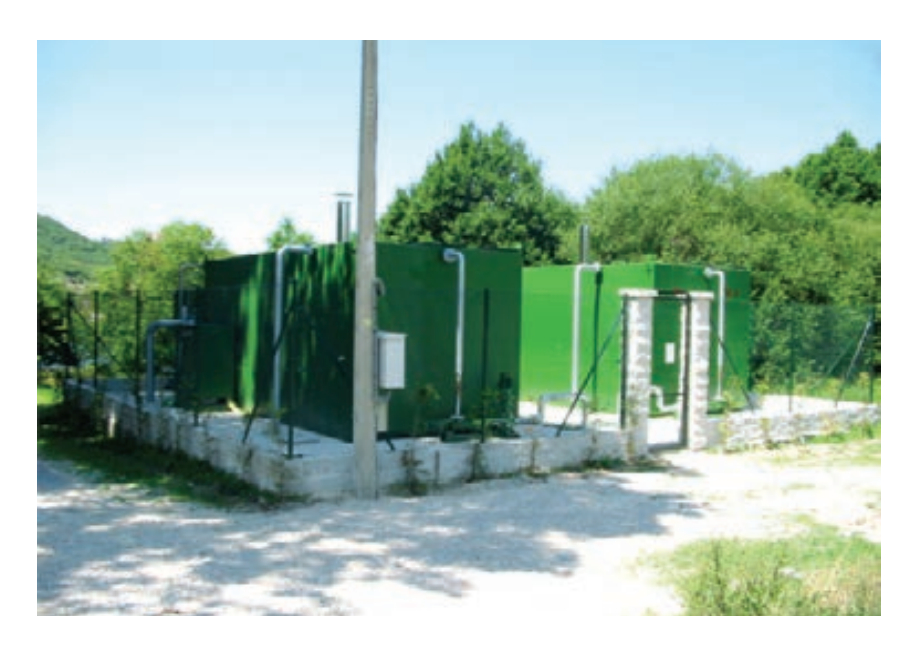
A VEIGA OURENSE Council Capital. 865 m above sea level

Equivalent Inhabitants: 1,238 Treated Flow Rate: 84,700 m<sup>3</sup>/year Discharge: Dam of Prada, Jares Fish River