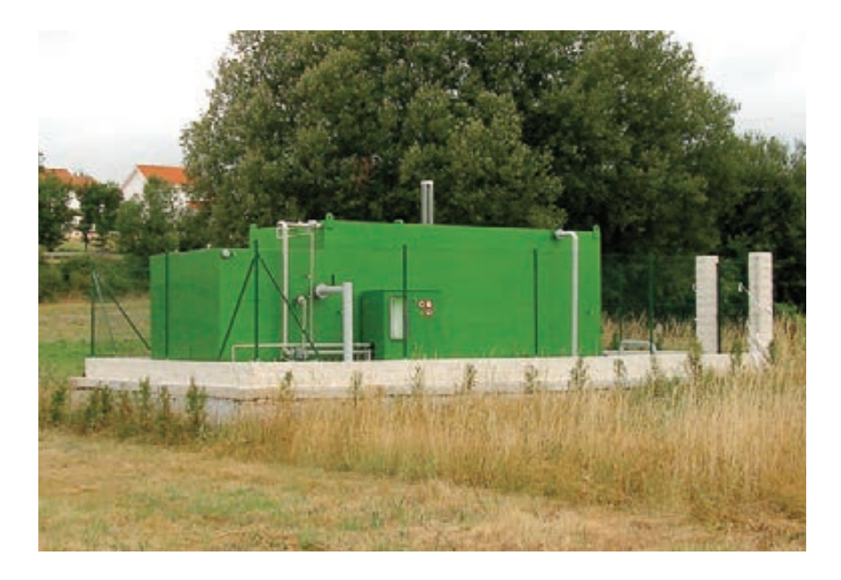
A MERCA OURENSE Rural area of A Manchica

Equivalent Inhabitants: 351 Treated Flow Rate: 24,360 m³/year Discharge: Barbaña River